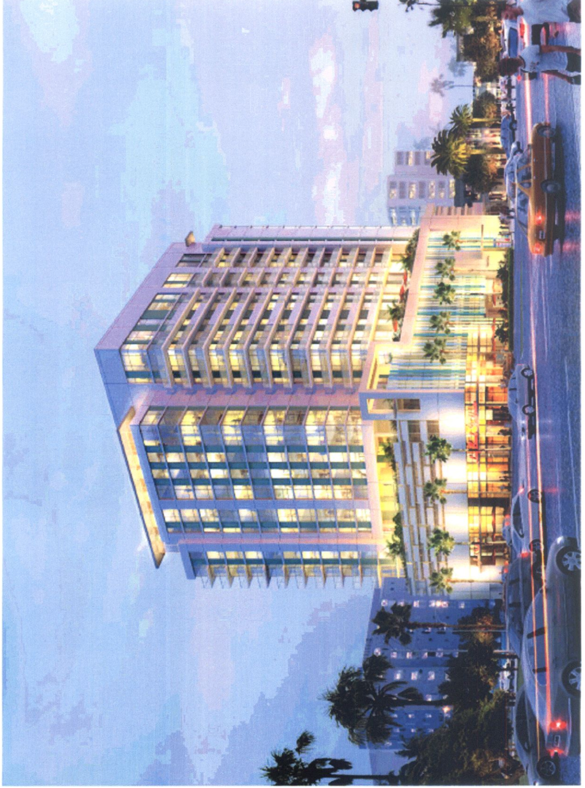
Exhibit D – Shoreline Gateway Phase One (West Tower)